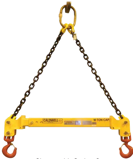
Shown with Option C