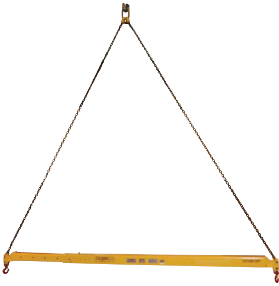
Shown with Option C