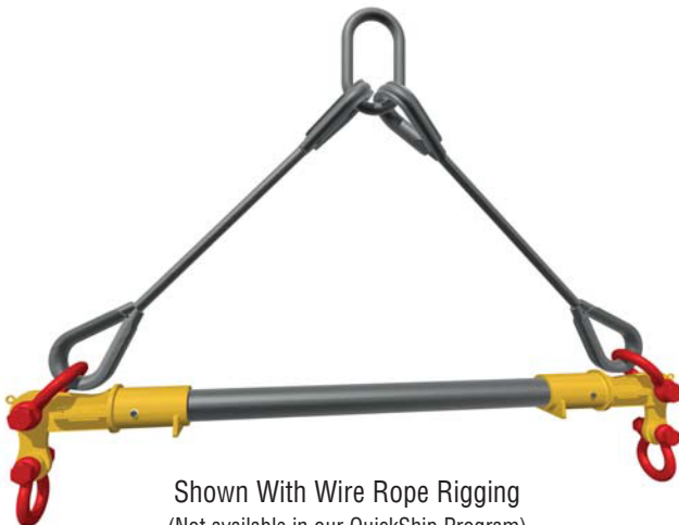
Shown With Wire Rope Rigging (Not available in our QuickShip Program)