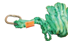
Top Rigging - 2 ton

Other Top Rigging Options (consult factory for delivery information)